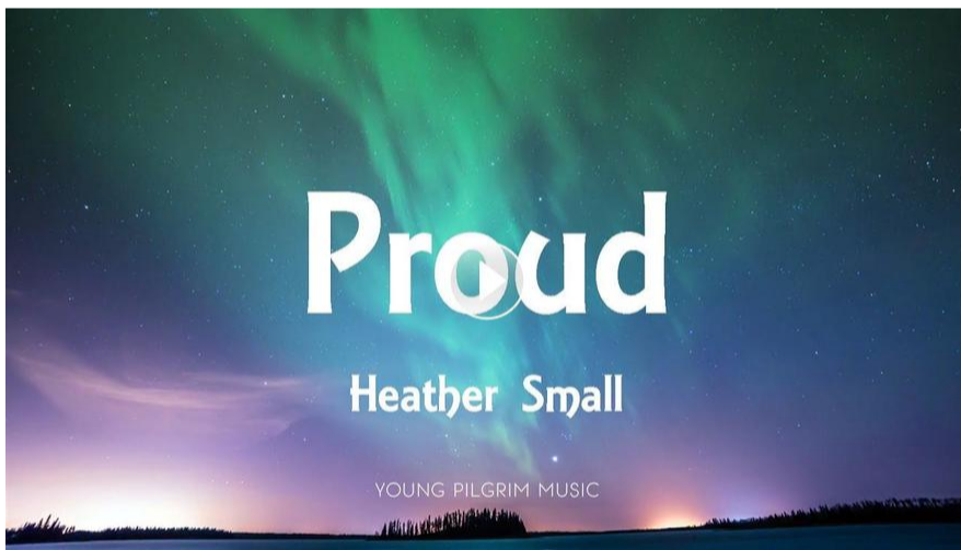
Proud by Heather Small (lyric video)

"Natchez, Mississippi, once had more millionaires per capita than anywhere else in America, and its wealth was built on slavery and cotton. Today it has the greatest concentration of antebellum mansions in the South, and a culture full of unexpected contradictions. Prominent white families dress up in hoopskirts and Confederate uniforms for ritual celebrations of the Old South, yet Natchez is also progressive enough to elect a gay black man for mayor with 91% of the vote...." Click the picture to learn more or to purchase the book!