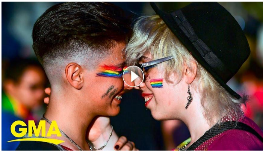
The Story of the Pride Parade - GMA